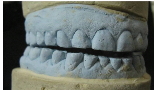
FIGURE 4: Restoration of vertical dimension on articulator.

Clinical examination revealed severely worn anterior and posterior teeth (Figures 1 and 2). On evaluation and diagnosis, patient's behavioural history related to stress which may have led to parafunctional habits. Endodontic and periodontal status was good except for mandibular left and right central and lateral incisors which needed endodontic treatment. Evaluation of the TMJs was unremarkable, with normal jaw opening and range of motion. No joint sounds, signs or symptoms of instability were evident. Joint loading in centric relation was performed utilizing bimanual manipulation.