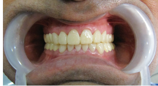
FIGURE 7: Provisional restorations were placed.

The etiology of occlusal wear for our patient is not fully understood; however, it can be hypothesized that the patient had history of stress which may have led to parafunctional