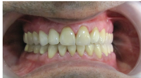
FIGURE 8: Definitive restoration.

occlusal habit and started grinding his anterior teeth. Once the anterior teeth got shorter, the patient lost anterior guidance and developed posterior interferences. The posterior interferences in lateral excursions can activate the masseter and temporalis muscles, enabling the patient to generate more forces to grind his teeth more aggressively [9]. A mutually protected occlusal scheme was used to prevent the destruction of the new prostheses.