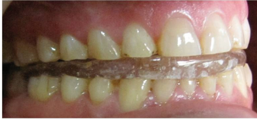
FIGURE 5: Occlusal splint in place.