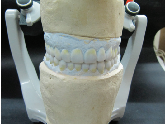
FIGURE 6: Diagnostic wax-up.

was done and impression was made with single-step putty-wash technique using additional silicone material. The working casts were articulated using facebow transfer and interocclusal centric record at previously determined vertical dimension. The provisional restorations were fabricated using putty index by the indirect technique, it was finished and corrected for occlusal interferences and luted with eugenol free temporary luting cement (Figure 7).