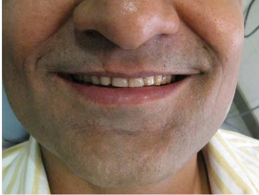
FIGURE 1: Preoperative extraoral view.