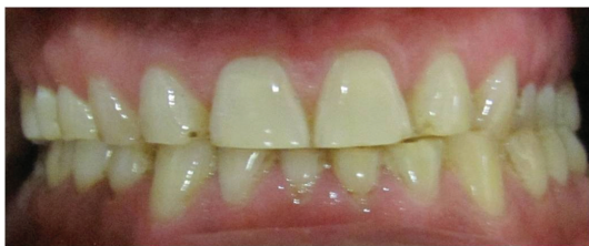
FIGURE 2: Preoperative intraoral view.