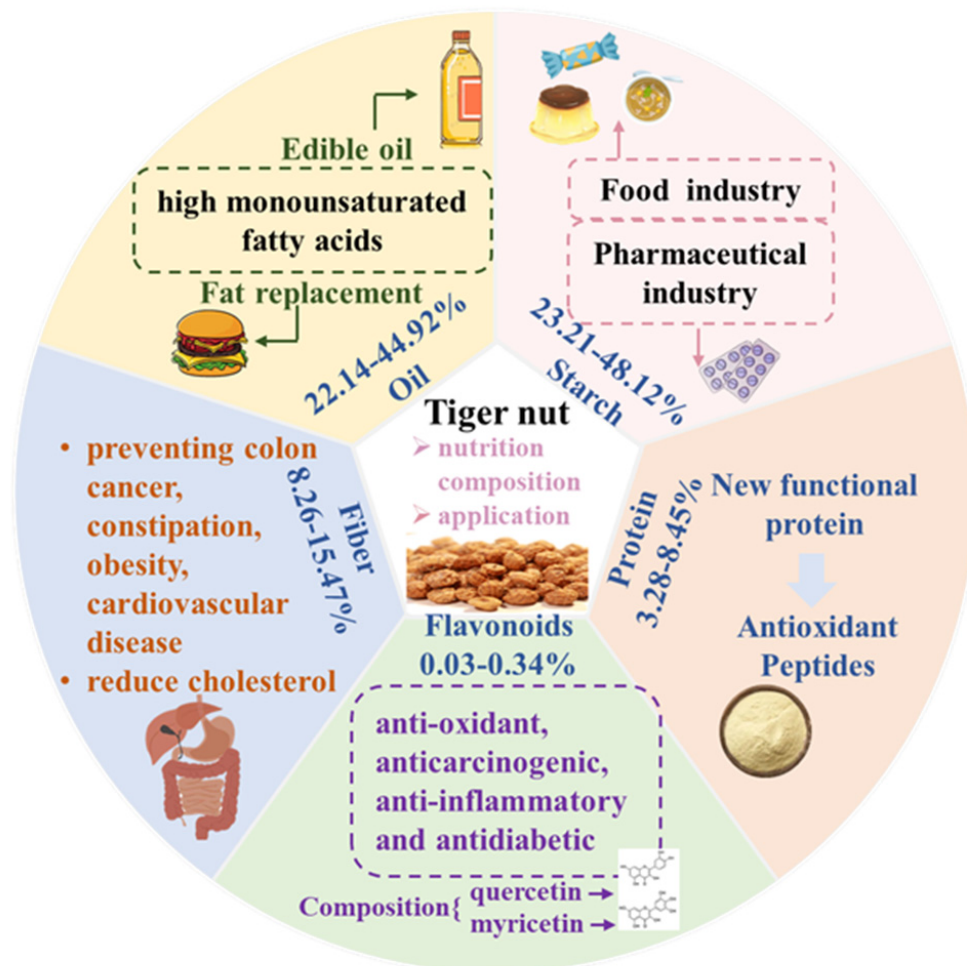
Figure 1. The main nutrition composition and nutrient-based applications of tiger nut.

heart disease after consumption [3,8]. The dietary fiber in this tuber is effective in the prevention of colon cancer, obesity and gastrointestinal disorders [9]. Due to the presence of flavonoids, the tiger nut has good antioxidant properties and can be used as a source of natural antioxidants [10].