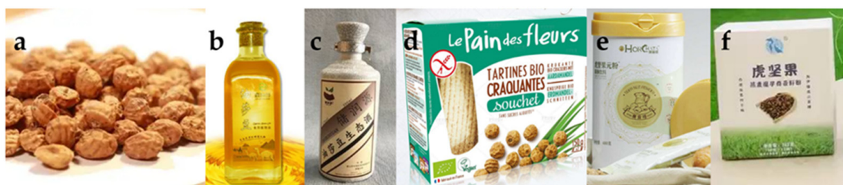
Figure 4. Tiger nut tuber and its products ((a) tuber; (b) edible oil; (c) liquor; (d) crunchy bio toast; (e) solid powder drink; (f) meal replacement powder).

Tiger nut contains a high amount of starch that is easy to gelatinize during the pasteurization process, leading to the coagulation of the milk and limits the output. Exogenous amylase can be used to increase the yield through the in situ hydrolysis of starch, which is a process that increases the sweetness of milk and is suitable for the industrial production of tiger nut milk [67]. In addition, heat treatment could cause the loss of nutrients such as the total protein, phenols and vitamins of the tiger nut milk. Compared with thermal processing, non-thermal processing retains the nutritional quality and is more suitable for the production of tiger nut milk [68]. In non-thermal processing, ultra-high-pressure homogenization [69], short-wave ultraviolet treatments [70] and pulsed electric field [71] can effectively inhibit the growth of microorganisms and extend the shelf life. On the other hand, studies have shown that the microencapsulation of tiger nut milk by a blend of inulin and modified tiger nut starch can make a product with good characteristics and shelf life [72].