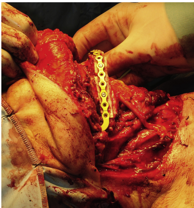
Fig. 4. Osteotomised radial bone forming the neomandible, held by titanium reconstruction plate.

Tumour ablation resulted in a bony defect extending from the left parasymphysis to the right ramus of mandible (Fig. 3) which was reconstructed with the segment of osteotomised radial bone held with a carefully contoured preformed titanium reconstruction plate (Fig. 4). The fasciocutaneous portion was used to reconstruct the large soft tissue defect of the right anterior floor of mouth and ventral tongue.