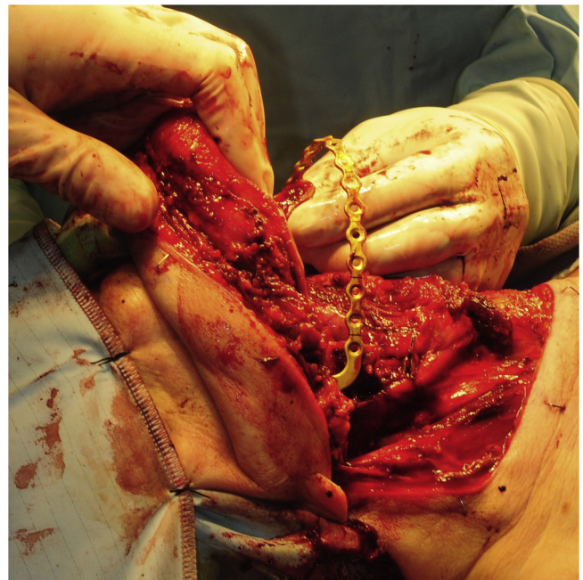
Fig. 3. Resulting complex defect anterior floor of mouth, ventral tongue and mandible.

Fig. 1 ) in addition to the fasciocutaneous component which can be dissected free from the vascular pedicle and folded under the skin paddle to provide additional bulk to this normally thin flap ( Fig. 2 ). This combination of an osseocutaneous radial forearm flap and use of a beavertail modification to provide additional bulk to reconstruct a complex hard and soft tissue defect has not been described in the literature.