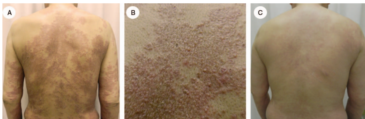
Figure 1. Photograph showing the patient's skin rash. (A) Before treatment, dark red papules and nodules fused into erythema-related situation, taking a geographic form on the trunk and 4 extremities, and particularly on the back. (B) Close-up photography of the skin rash on the back before treatment. (C) After 6 months of treatment, the exanthema changed to postinflammatory pigmentation, with significant improvement up to almost cure.

was admitted to our department in November 2014 secondary to fever, fatigue, nausea, and anorexia. The patient had no other relevant past or family history, including autoimmune diseases or liver diseases, and denied history of surgery, trauma, or drug allergies. The patient was not receiving any medications or dietary supplements. Physical examination was significant for the skin rash only, with no lymphadenopathy. Laboratory tests showed an elevated C-reactive protein (CRP) level of 23.3 mg/dL, an elevated corrected calcium level (correction based on the serum albumin level) of 12.8 mEq/L, a normal 25-hydroxyvitamin D level (29 ng/mL; normal range: 7–41 ng/mL), and an elevated 1,25-dihydroxyvitamin D level (124 pg/mL; normal range: 20–40 pg/mL). Parathyroid hormone (PTH) and PTH-related protein levels were low. There were no abnormalities in the urinalysis. There were no other abnormalities that could explain the patient's hypercalcemia (Table 1).