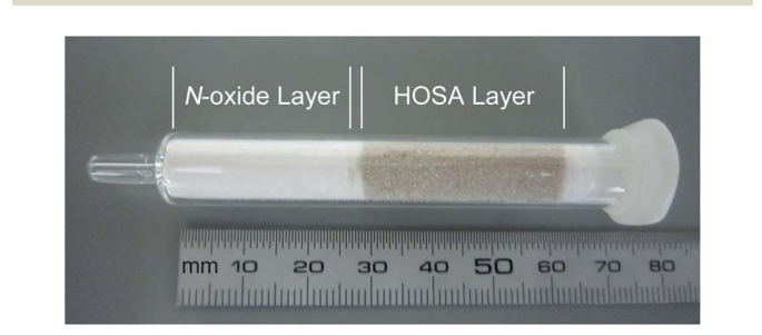
Fig. 1 External view of reaction column. The video showing the method for the preparation of the reaction column is available in ESI.†

Table 3 Yield, purity, and molar activity of [<sup>11</sup>C]HCN