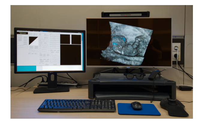
Figure 4 Three-dimensional virtual reality desktop system. An embryo of 9 weeks' gestational age is displayed on the 3D monitor; the brain cavities are coloured in light blue (and the brain cavity volume is measured automatically)

delivery. The main outcome measures are differences in maternal haemodynamic adaptation to pregnancy between women with and without placenta-related pregnancy complications. A more detailed description of the HAPPO study protocol has been published separately.<sup>17</sup>