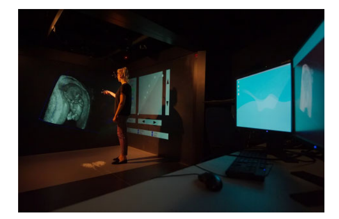
Figure 3 I-Space virtual reality system. A fetus of 12 weeks' gestational age is displayed on the front wall. The researcher is wearing 3D glasses to observe real depth perception and interact with the dataset by using a joystick. Be aware that real depth perception cannot be shown on paper

In collaboration with the Biomedical Imaging Group of the Erasmus MC, new innovative research will use deployment of artificial intelligence (AI) to focus on fully automated analyses of 3 D ultrasound data, with the goal to