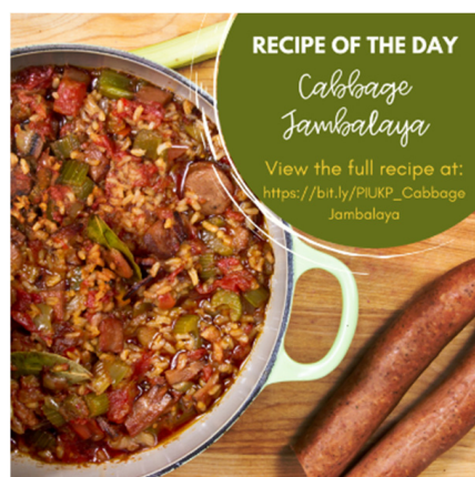
Figure 2. Example of a post for O+I Facebook group participants.

The general content of the messages was previously tested and validated in a grocery store intervention among rural residents living counties with high rates of poverty, obesity, food insecurity, and poor diet quality [24]. The content of the messages has been utilized in previous studies, showing acceptability, efficacy, and modifying behavior [25]. However, the exact wording was derived by research assistants based on four primary principles, (1) supporting self-efficacy, (2) providing simple and affordable recipes, (3) utilizing affective language, and (4) offering encouragement and motivational language to support positive behaviors. The study team based the text messages on “Nudge Theory”, which indicates that low-cost text messages can have broad applications to guide a healthier lifestyle. As coined by Thaler and Sunstein, the authors suggest that there exists a “choice architecture”, which involves outside forces that guide decisions [26]. The outside force in this intervention was the physical grocery store but also the online platform where food choices were being made when items were placed into the shoppers’ online grocery cart. Results from a meta-analysis on nudge interventions indicated that, on average, a nudge resulted in a 15% increase in healthier consumption [27]. Thus, the study is grounded in nudge theory and is utilizing this approach through healthy text messages being sent at crucial “choice” moments when shopping online.