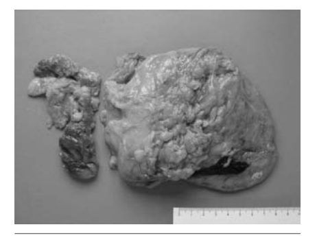
Figure 2. Retropelvic lipoma after its removal.