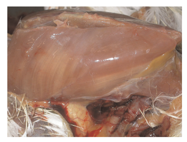
Figure 4 Pectoral muscles of a chicken affected with vitamin E and selenium deficiency, showing severe locally extensive areas of degeneration and necrosis, which is noted by the presence of light colored streaks of affected muscle.

Vitamin B_6 participates in the metabolism of amino acids. As a consequence, there is no specific list of signs related to its