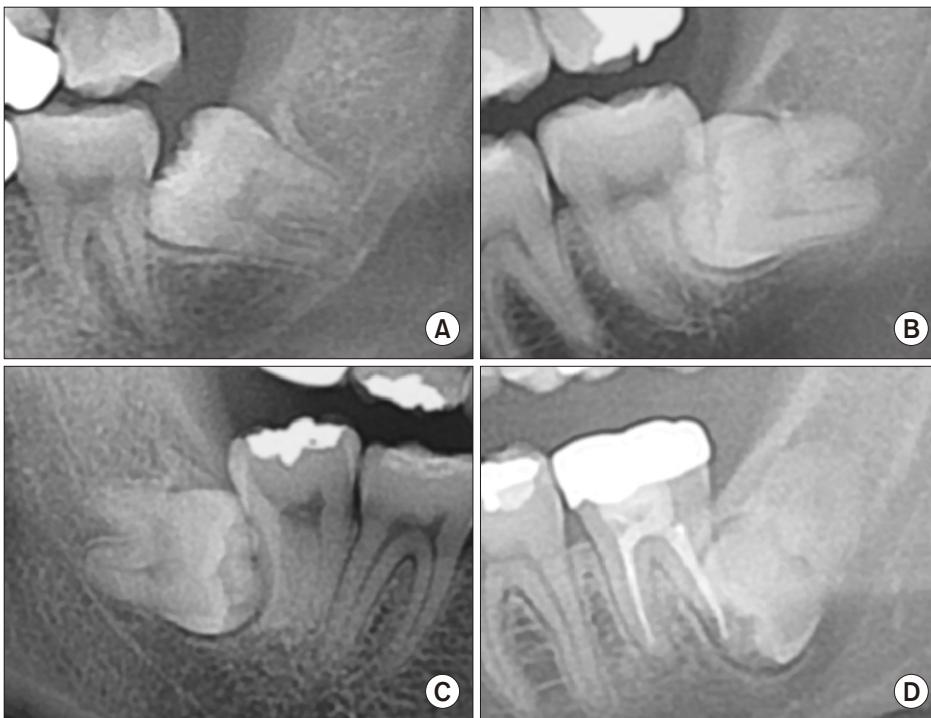
Fig. 3. Depth. A. Level A, when more than half of the crown of impacted third molar was existing above the cervico-enamel junction (CEJ) of the adjacent second molar. B. Level B, when less than half of the presented crown was above the CEJ. Level C (C) and Level D (D), when the entire crown of the impacted third molar was located below CEJ of the adjacent second molar. Level C was defined as a condition when more than half of the impacted third molar crown was located superior to the mid-level of the adjacent second molar root. Third molar crown levels inferior to the aforementioned reference was categorized as level D.

According to the difficulty, the spatial relationship was scored on a scale of 1 to 5 as follows: Mes (1), Hor (2), Ver (3), Dis (4), and Rev (5) 8 . For depth, 1 to 4 points were assigned