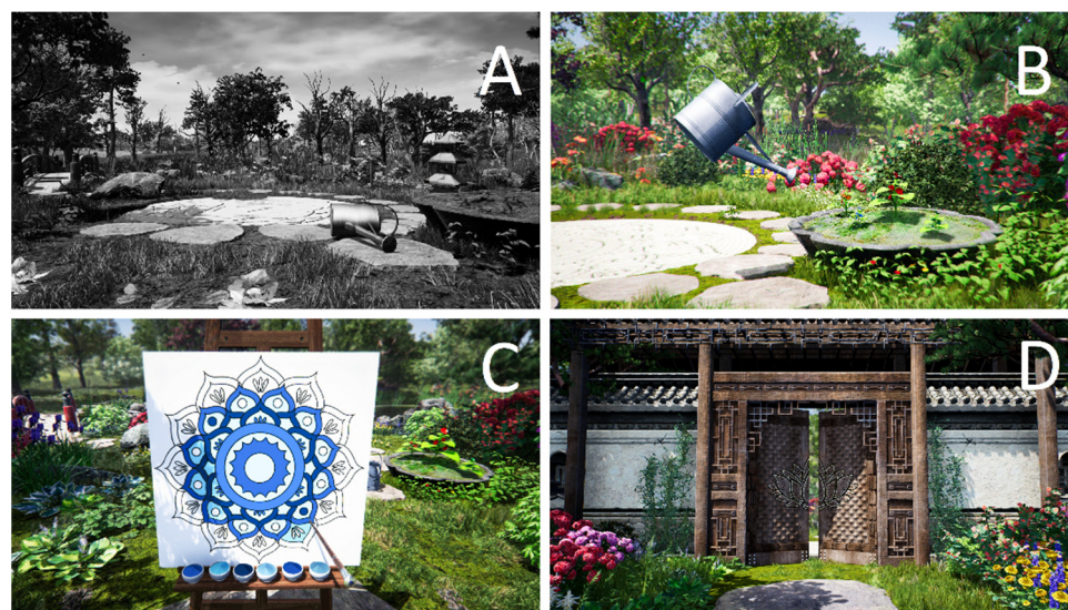
Figure 2. Garden of Revival screen captures: (A) initial stage of the therapy; (B) final stage of the therapy; (C) mandala colouring task; (D) gate leading to the Garden of Revival.

In the Virtual Therapeutic Garden, there is a rich set of symbols and metaphors based on the Ericksonian psychotherapy approach. The most important is the Garden of Revival, which symbolises the patient’s health. The metaphor of the garden, weakened and grey in the beginning (Figure 2A), and becoming more and more colourful and lively with every session symbolises the process of regaining energy and vigour (Figure 2B).