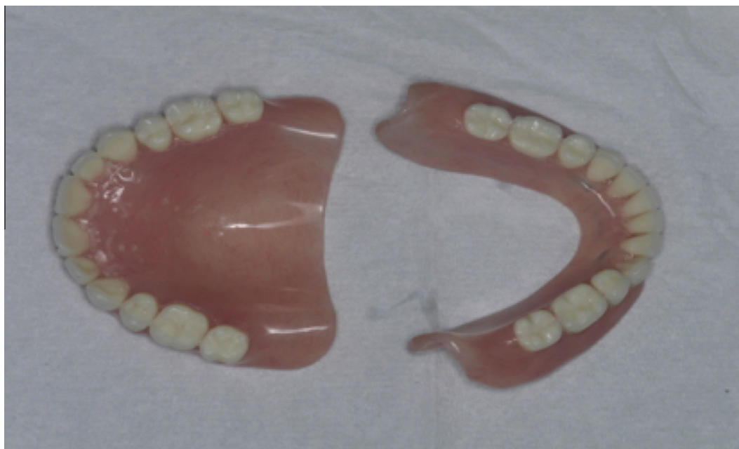
Figure 5 Perfect shape of the outer surfaces.

indicating paste (pip; Mizzy™, Myerstown, PA, USA) and only minimal adjustments were needed. In addition, both the centric and eccentric occlusions required only minor adjustments (Figs. 5 and 6).