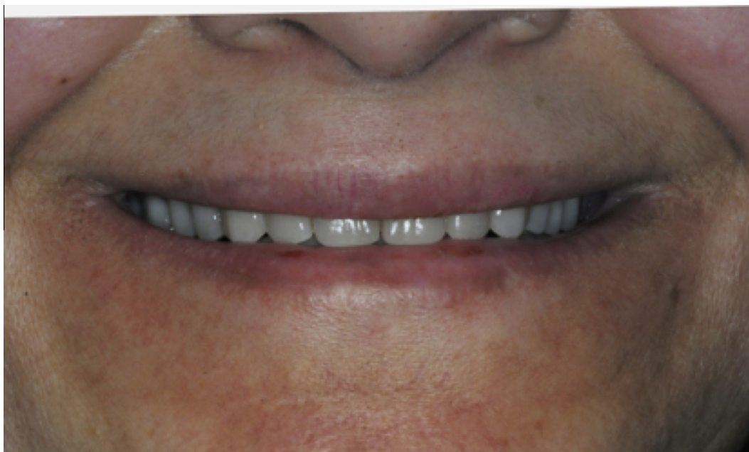
Figure 8 The patient preferred the conventional dentures since the incisors appeared smaller and greater lip support was provided.

and highly compressed acrylic materials. In contrast, Dentca uses computer software to produce virtual prostheses, and the dentures are subsequently fabricated using a conventional processing technique (Kattadiyil et al., 2013; Bidra et al., 2013; Goodacre et al., 2012).