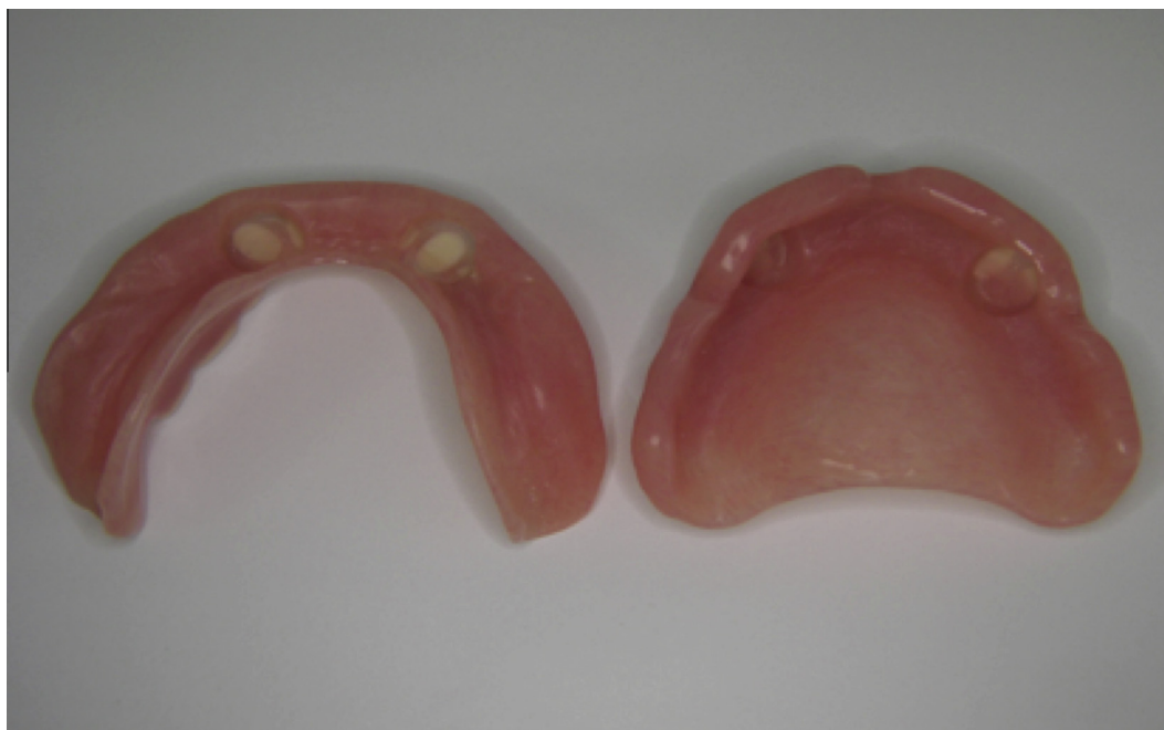
Figure 6 The flanges of the digital overdentures were nicely rolled.

AvaDent and Dentca are two commercial manufacturers of digital complete dentures worldwide, and both are based in the United States. (AvaDent Digital Dentures; Global Dental Science, http://www.avadent.com ; Dentca-CAD/CAM Denture; Dentca Inc, http://www.dentca.com ). AvaDent scans impressions with laser scanners and virtual dentures are produced with the use of sophisticated computer software. The bases are then milled from pre-polymerized