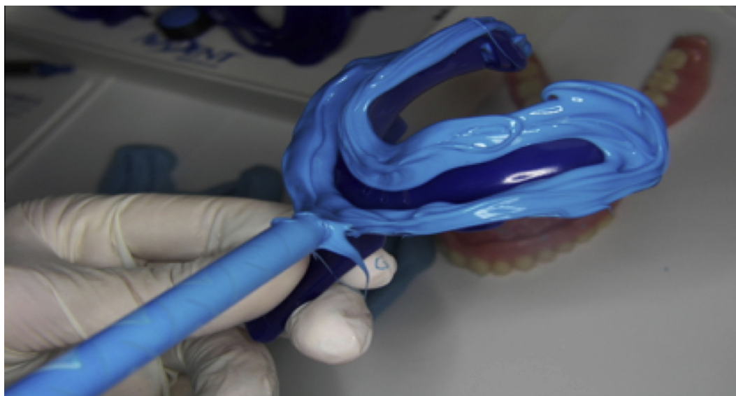
Figure 1 Border moulding of the lower tray.

laboratory time, materials, and expenses. Currently, CAD/CAM is used to construct digitally designed and milled custom complete dentures (Kanazawa et al., 2011; Kattadiyil et al., 2013). In contrast with the conventional technique of fabricating complete denture prostheses (Infante et al., 2014), CAD/CAM techniques use clinical and laboratory protocols that allow complete dentures to be fabricated over two clinical appointments (Bidra, 2014).