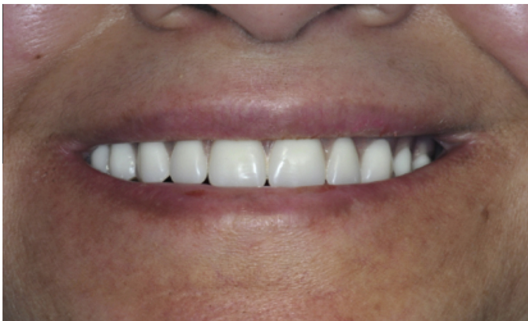
Figure 7 The final aesthetics of the dentures were not satisfactory to the patient or the dentist. The incisors appeared large and protruded.