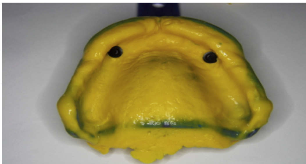
Figure 2 Final impression of the upper arch.

A detailed patient history was obtained and both clinical and radiographic examinations were completed before the clinical procedures were performed. Digital prostheses were