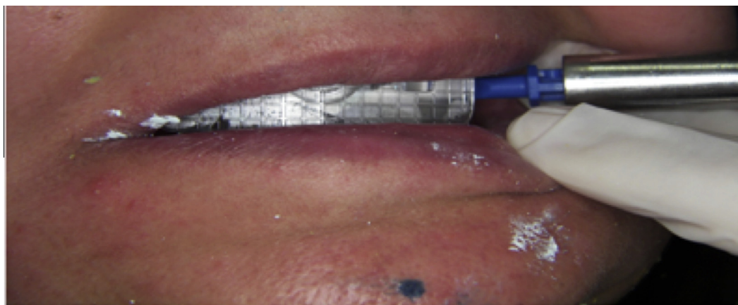
Figure 3 Vertical dimension of occlusion was adjusted on the AMD.

constructed using the AvaDent digital system (AvaDent™ Digital Dentures, Scottsdale, AZ, USA) with materials and techniques provided by the manufacturer. Briefly, maxillary and mandibular impressions were made using provided thermo-plastic trays and AvaDent heavy body and light body vinylpolysiloxane border moulding and impression materials, respectively (Figs. 1 and 2).