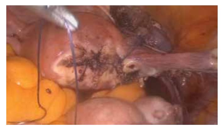
Figure 4. Metroplasty is performed with 2/0 polyglactin sutures Video 1. https://www.youtube.com/watch?v=LWb9juK3n2w