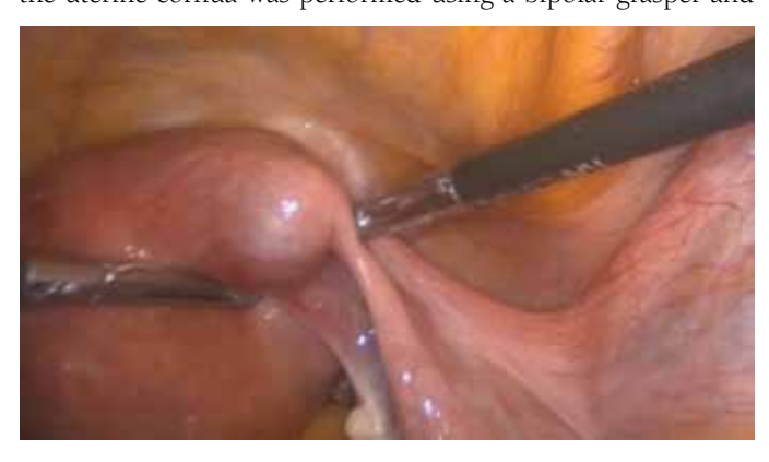
Figure 1. Right uterine cornual pregnancy

The patient was prepared in the Trendelenburg position with legs straight and arms tucked alongside the body. A 10 mm trocar was inserted through the umbilicus for endoscope access. Three 5 mm re-usable trocars were placed into the suprapubic area, and left and right lower abdomen. Exploration confirmed a cornual pregnancy in the right uterine cornu (Figure 1). The pelvic peritoneum over the psoas muscle was opened parallel to the right infundibulopelvic ligament, and then the external iliac artery, internal iliac artery, and ureter were identified. The right pararectal space was developed using blunt dissection between the right ureter and internal iliac artery. The uterine artery over the ureter was identified and isolated for a distance of 1.5-2 cm (Figure 2). The uterine artery was then coagulated by use of a bipolar grasper. The mesosalpinx of the right fallopian tube was coagulated and transected. A window was created above the ureter and then the uteroovarian ligament was coagulated and transected. The right cornu was avascularized and a resection of the uterine cornua was performed using a bipolar grasper and