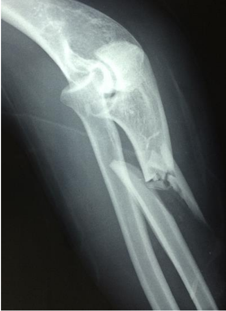
Figure 1: radiography of Monteggia fracture