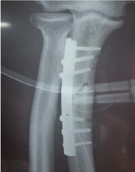
Figure 2: radiography post operative control