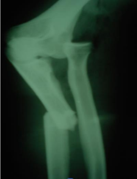
Figure 3: radiography showing the Monteggia fracture in a second patient