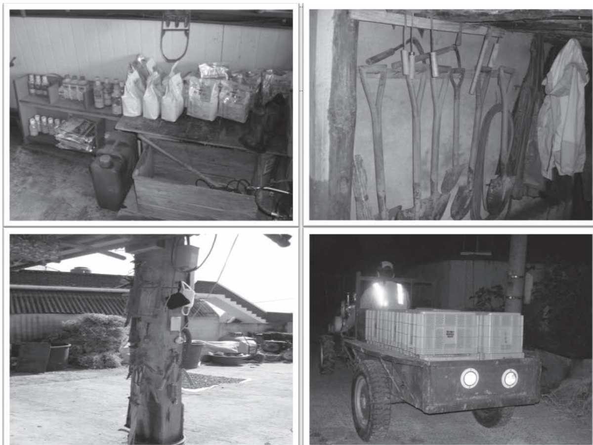
Fig. 2. Examples of improvement: Pesticide storage using a book self, storage for agricultural devices, home for small tools, reflective signs for night safety.

the farmers' own ideas and available local resources, they initially started with small, easy-to-implement improvements. Once farmers are trained in the participatory steps leading to the actual improvements, they can apply the sequential steps in a sustainable way to manage agricultural work-related risks. We can expect that they would expand their scopes to more challenging improvements in a step-wise manner (Fig. 2).