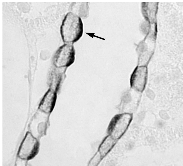
Fig. 2. Rh C glycoprotein (Rhcg) immunoreactivity is observed in both apical and basolateral membrane (arrow) in the rat cortical collecting duct.

The same year, a separate group (Verlander et al.) published a more detailed study in the mouse kidney 22 . The cellular distribution of Rhbg was similar with the report of Quentin et al.. However, Verlander et al. demonstrated that a subpopulation of intercalated cells do not express detectable Rhbg immunoreactivity. Colocalization with pendrin, an apical anion exchanger present in type B and non-A-non-B intercalated cells, revealed that CNT pendrin-positive cells (non-A-non-B intercalated cells) typically exhibited basolateral Rhbg immunoreactivity, whereas CCD pendrin-positive cells (type B intercalated cell) were negative for Rhbg. Subsequent studies also confirmed similar findings in the rat kidney.