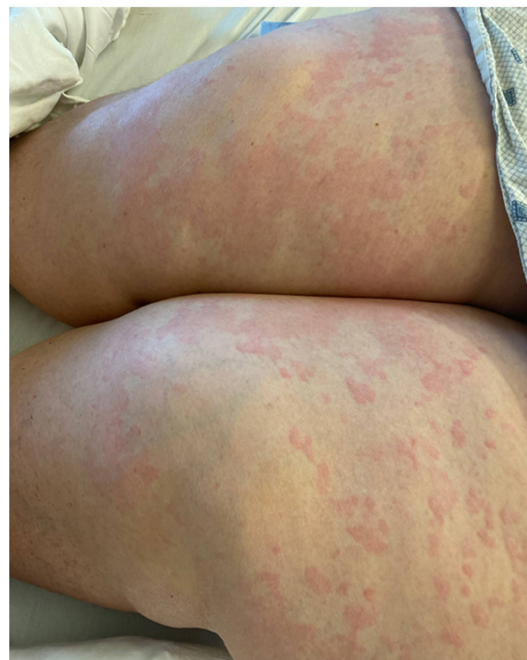
Figure 1 Diffuse urticarial rash on bilateral lower extremities.

A 54-year-old woman presented with shortness of breath for 1-day duration along with generalised weakness and diffuse rash associated with itching and burning sensation that progressively got worse for 3 days prior to presentation to emergency department. She denied any fever, chills, cough, nausea, loose stools, abdominal pain, joint pains or sore throat. She had no known exposure to COVID-19 positive people. On arrival in the emergency department, a COVID-19 test was performed given hypoxia (oxygen saturation 84% on room air) with new requirement of 2L of nasal cannula oxygen, empirically given present pandemic