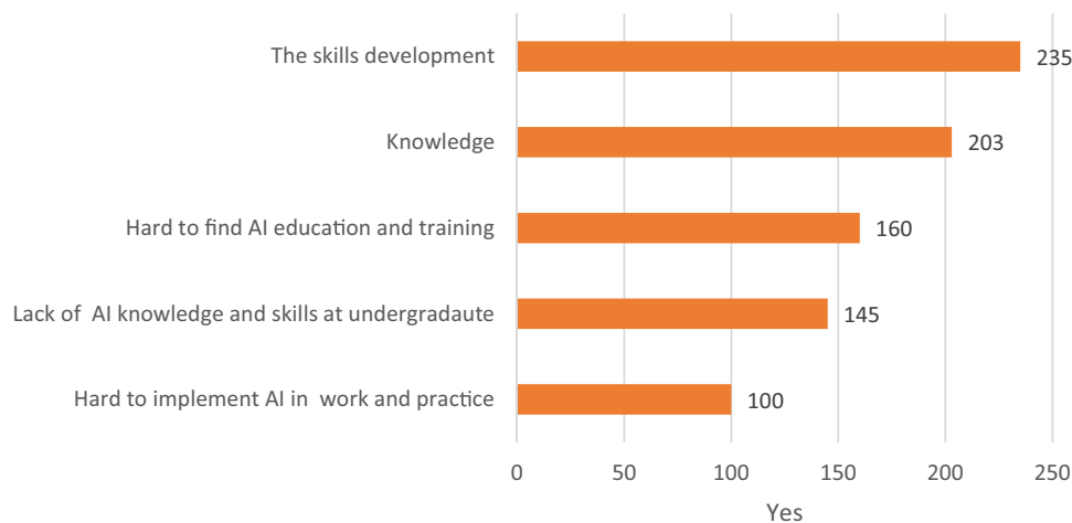
Fig. 1 AI implementation challenges

not show any difference among age groups. The highest AI application identified as necessary for the workplace was dose management (50.3%, n=276 ), followed by quality control (49.9%, n=274 ) and image evaluation (39.9%, n=219 ) (Fig. 2). Multiple responses were allowed for this question.