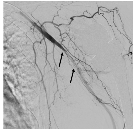
FIGURE 2: Limited angiography of the left upper extremity showing occlusion of the distal axillary artery and dissection of the proximal brachial artery (arrows).