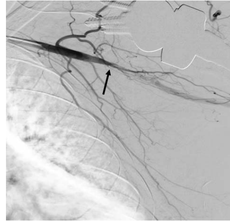
FIGURE 1: Angiography of the left upper extremity showing total occlusion of the axillary artery (arrow).

The patient tolerated the procedure well and developed easily palpable brachial, radial, and ulnar pulses immediately post-op. One month after angioplasty, the patient's numbness, tingling, and the cold sensation in his hand have resolved but he continues to have pain and decreased strength. Upper extremity arterial Doppler one month after angioplasty showed significant improvement in the left digit pressures and waveforms which appeared to be essentially normal at rest. Upper extremity arterial duplex showed patent stent in the left axillary artery and brachial artery. Arterial Doppler and duplex nine months after angiography continue to show normal left digit pressures and patent axillary artery stent,