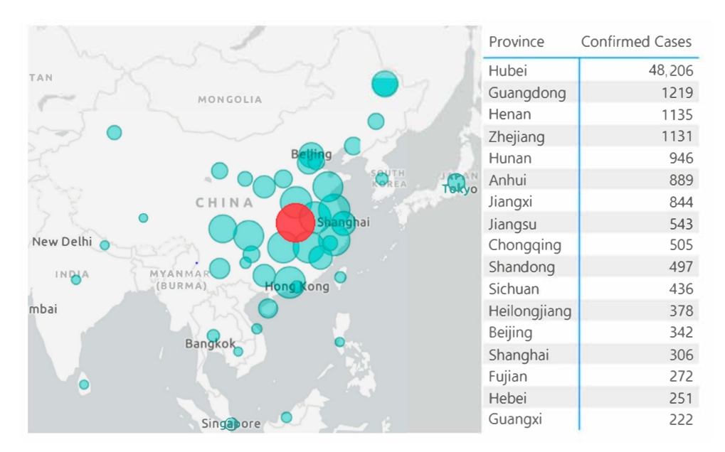
Figure 2. Bubble map visualization of the disease distribution around China, with data taken from [70], obtained on 13 February 2020. Created using Power BI Desktop.