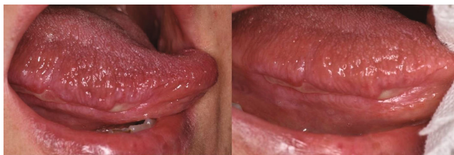
FIGURE 2: Extensive ulcer localized on the right margin of the tongue.

areas of keratinocyte necrosis; few CD4 T-lymphocytes and rare CD20 B-cells were also found.