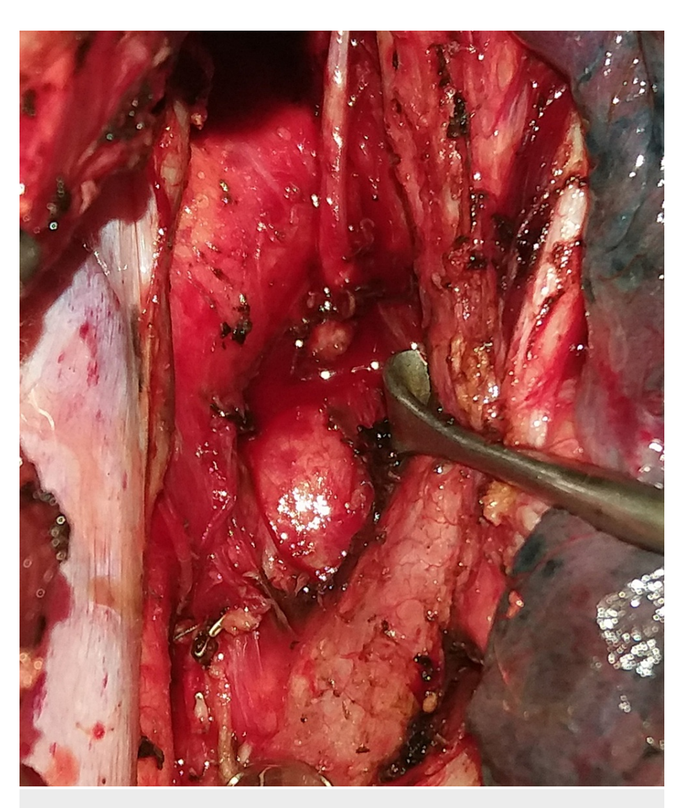
FIGURE 2: Aorto-pulmonary lymph nodes