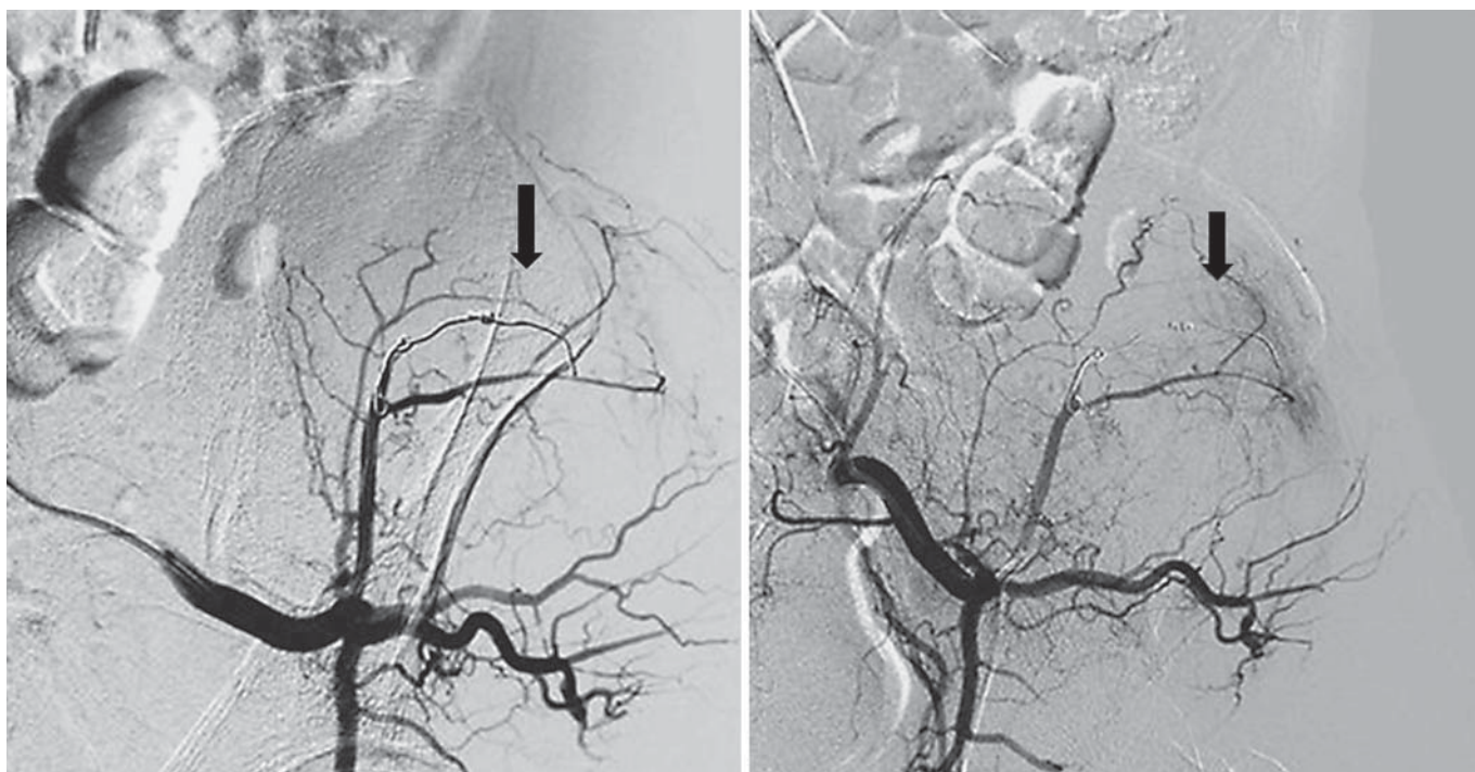
Fig. 3. Angiogram images not showing AVF after successful embolization with a shifted coil.

AVF was observed in the left superior gluteal artery after selective catheterization of the left internal iliac artery in the region corresponding to the bone marrow aspiration and biopsy site (fig. 1). Selective embolization was achieved in the same session and the bleeding stopped (fig. 2, 3).