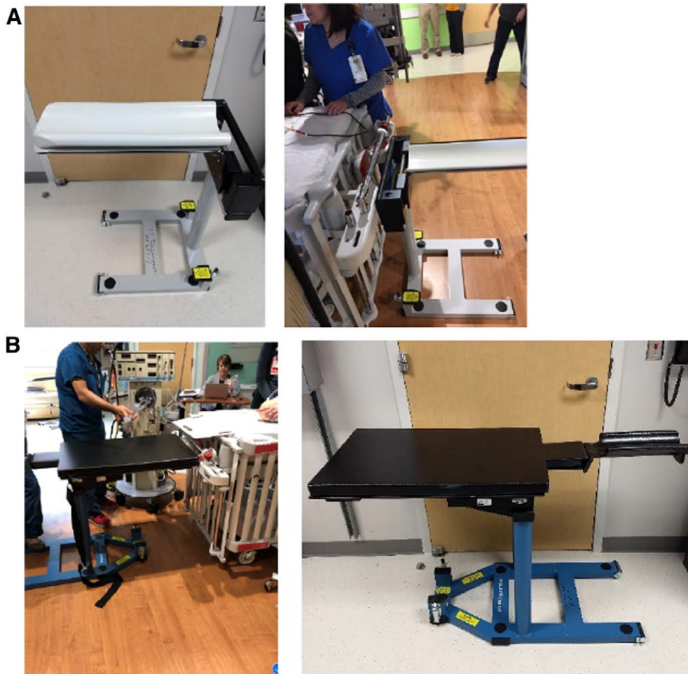
Fig. 2. Custom-made board and adaptor that was made in response to the latent safety threats identified. A, NSP for patients less than 7 kg. B, Pediatric scanning platform for patients 7–40 kg.

cables, and wires) were positioned, the total care adapter was attached to the bed, and the custom-made silhouette board was put in place. The patient was moved onto the silhouette board and positioned into the scanner.