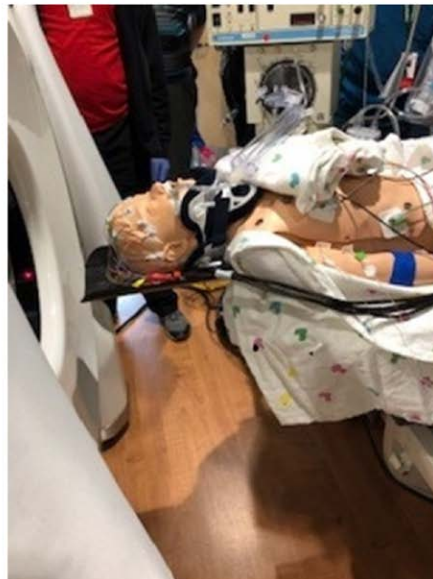
Fig. 1. Universal bed adaptor and how it was used during the simulation that led to the identification of latent safety threats. A, Universal bed adaptor (PDSA1) round 1. B, LST identified with the Universal bed adapter.

the universal bed adapter did not attach securely to our beds, leading to a risk of patient falls and potential staff injury. This finding led key stakeholders to pause portable CT scanner implementation until a custom bed adapter and silhouette board could be manufactured (Fig. 3).