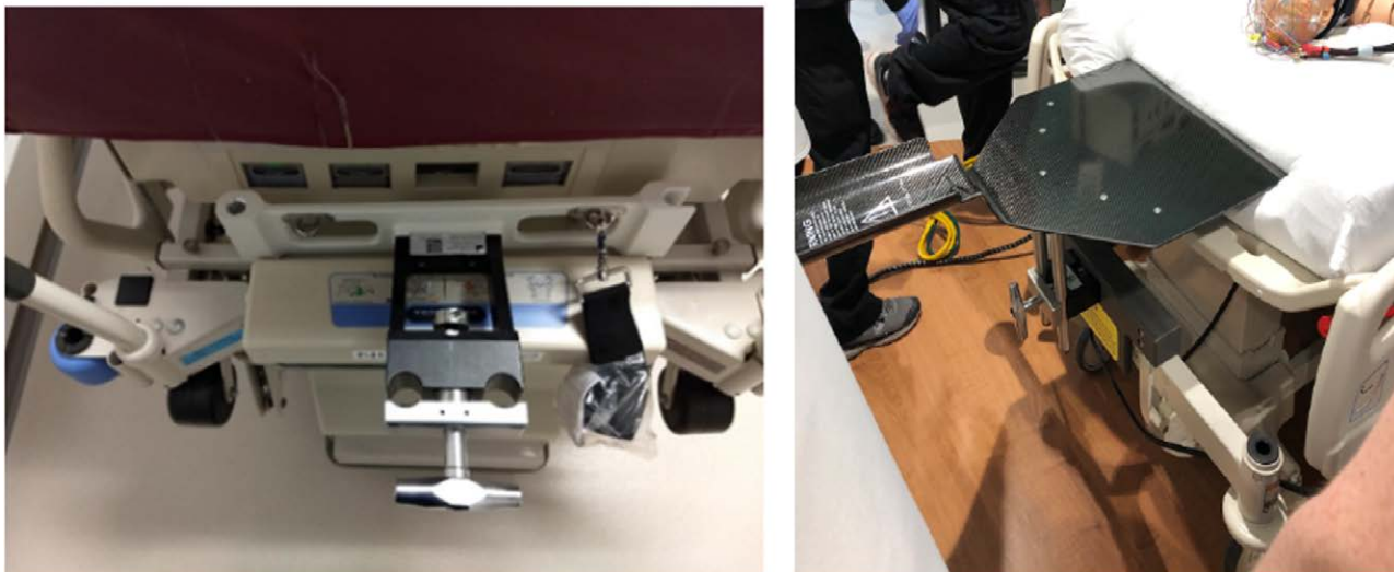
Fig. 3. Hill-Rom care assist ES bed and low air loss bed with total care adapter and custom silhouette board (round 2: PDSA 4). A, NSP. B, Pedi scanning platform.