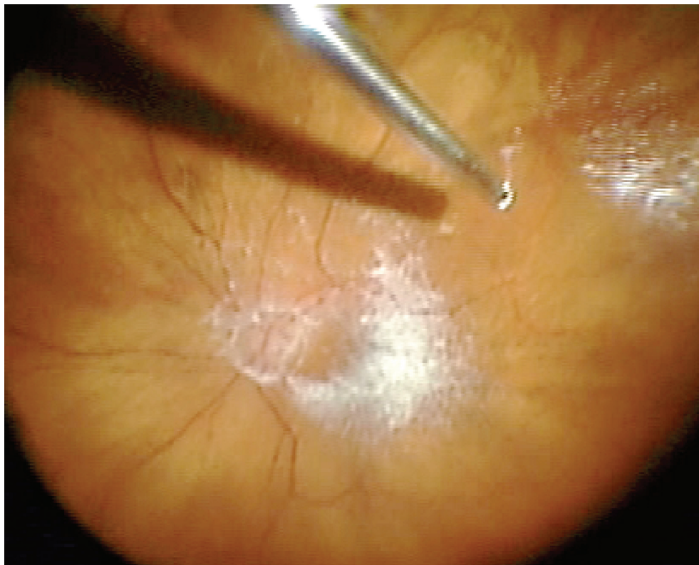
Figure 3 Enhanced visibility of epiretinal membrane with triamcinolone.

One of the most common reasons for failure of RD repair is proliferative vitreoretinopathy (PVR). PVR is proliferation and subsequent contraction of a fibrous nonvascular epiretinal membrane at the vitreoretinal interface generally stimulated by rhegmatogenous retinal detachment (Girard et al 1994; Furino et al 2003). Subsequent surgery for RD with PVR is tedious and problematic as it is generally associated with poor anatomic and visual outcomes. One of the established treatments for PVR is PPV with the surgical goal to remove any residual vitreous and tractional ERMs. Removal of the ERM is thought to be the most important factor influencing clinical outcomes after surgery for PVR (Aaberg 1988; Abrams et al 1997; Girard et al 2004; Ueno et al 2007).