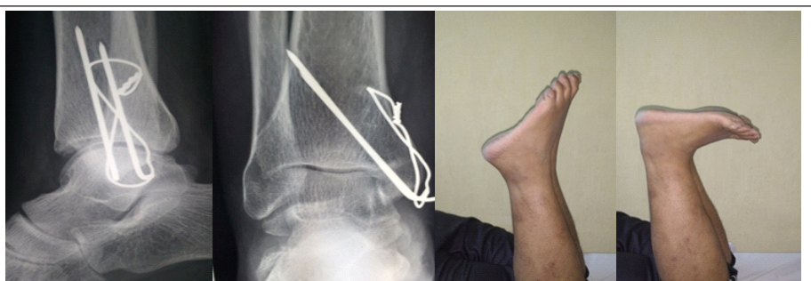
Figure 4 a & b: Plain radiographs at 3 years follow-up showing fracture union (anterior posterior and lateral). (c & d) Clinical images at latest follow-up showing symmetric plantar and dorsiflexion of both ankle joints.