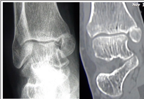
Figure 1: Plain radiograph and coronal computed tomography images showing medial malleolar nonunion.