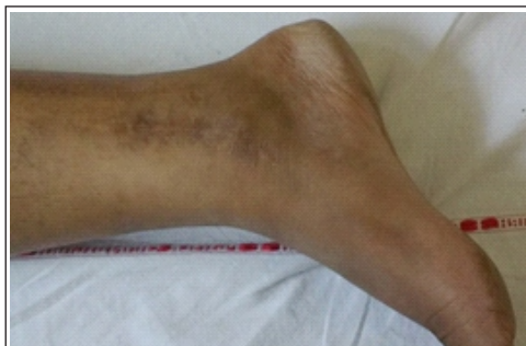
Figure 5: Clinical image is showing well-healed scar at the last follow-up (3 years).

(two of these cases were treated nonoperatively in the acute stage, and the other case went into nonunion after