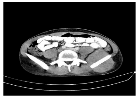
Figure 2 : Pelvic Computerized Tomography showing diffuse enlargement of left Paraspinal,iliopsoas and gluteal muscles

Thoracic and lumbar Magnetic Resonance Imaging (MRI) revealed multiple signal intensity lesions in dorsal and lumbar vertebrae with heterogeneous enhancement after contrast injection. There was not any intervertebral disk involvement. There was also significant contrast enhancement in the left paraspinal muscles, mainly on the left iliopsoas and iliacus.