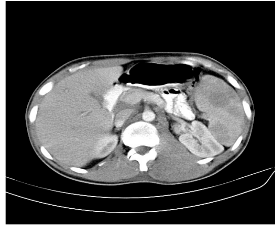
Figure 1: Abdominal Computerized Tomography showing multiple hypodense lesions in the spleen