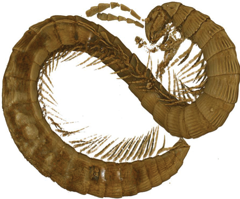
Figure 3. Burmanopetalum inexpectatum gen. nov. et sp. nov., female holotype (ZFMK-MYR07366), 3D model, volume rendering.

prefemur (Fig. 1F). Tarsus 2 with a short claw. Leg 1 and 2 not visibly modified. Some midbody legs with coxal vesicles.