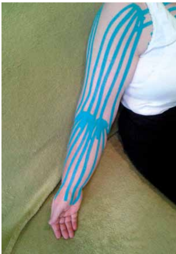
Fig. 1. KT application in the presented case study

A 62-year-old woman was admitted for decongestive lymphatic therapy in October 2012. In June 2005, the patient was diagnosed with a tumour in the right breast (after mammography, NMR and needle biopsy, the Paget cancer was recognised) and qualified for modified radical mastectomy (with resection I and II floor of lymphatic nodes). She underwent chemother-