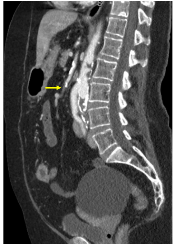
Fig 1. Sagittal computed tomography angiography (CTA) image showing superior mesenteric artery (SMA) occlusion (arrow).

Open bowel resection is required for the management of bowel infarction. Patients with an acute abdomen on examination or signs of bowel necrosis and/perforation on imaging are brought emergently to the operating room for laparotomy, bowel resection, and revascularization with SMA embolectomy. For the present patient, laparotomy and open embolectomy were considered; however, given her body habitus, the reoperative nature of her abdomen, multiple comorbidities, including COVID-19 positivity with chronic obstructive pulmonary disease and coronary artery disease, and evidence of distal anastomotic stenosis of the left limb of the aortobifemoral graft, we believed endovascular intervention would be more expeditious and less morbid. Open vs endovascular revascularization should be determined on a case-by-case basis, and consideration should be given to the patient's condition, imaging findings, and the