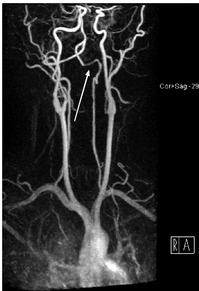
Figure 2 Magnetic resonance imaging maximum-intensity projection with gadolinium demonstrates irregularity and decreased vessel caliber to the V3 segment of the left vertebral artery (white arrow). This is a characteristic finding in an arterial dissection.

presentation of a Brown-Séquard syndrome with VAD as an underlying etiology has been reported only once before in the literature [4].