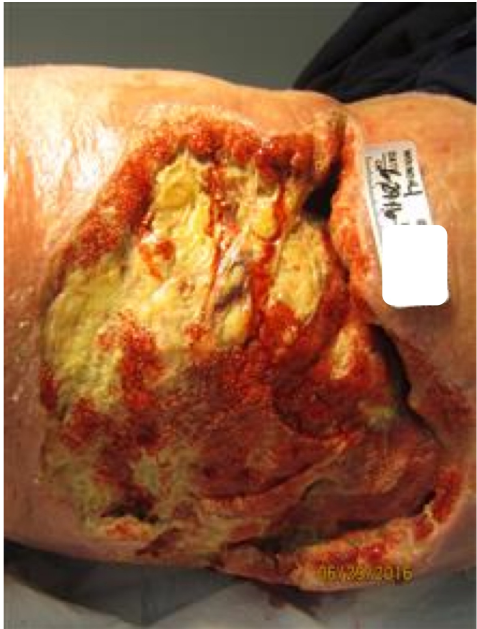
FIGURE 4: Right Upper Thigh Wound Three Weeks Postop

The patient returned to the outpatient wound care clinic for his initial follow-up after surgical debridement, discharged from the hospital and the long-term acute care facility. The VeraFlo™ therapy consisted of almost three weeks of treatment, which continued cleaning and stimulating the wound. Red, beefy healthy granulation tissue formed, filling in the deep areas with healthy tissue. A regular wound vac was placed.