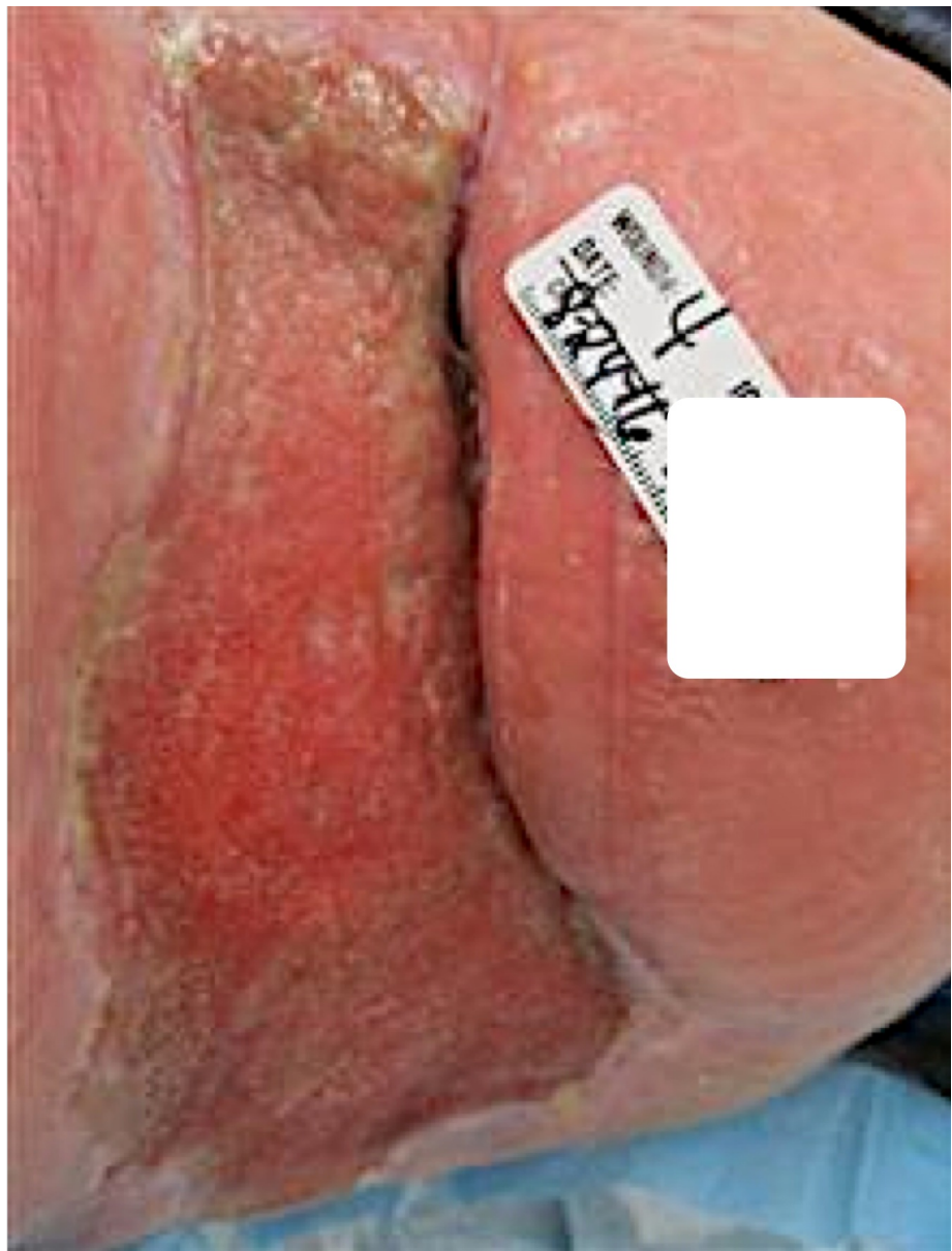
FIGURE 5: Right Upper Thigh Wound - One Month, Three Weeks Into Healing

One month and three weeks after surgical debridement the wound is healing and healthy. Measurements are 10.5 cm length x 22.5 cm width x 1.8 cm depth. Granulation and epithelization tissue continues to form with no complications.