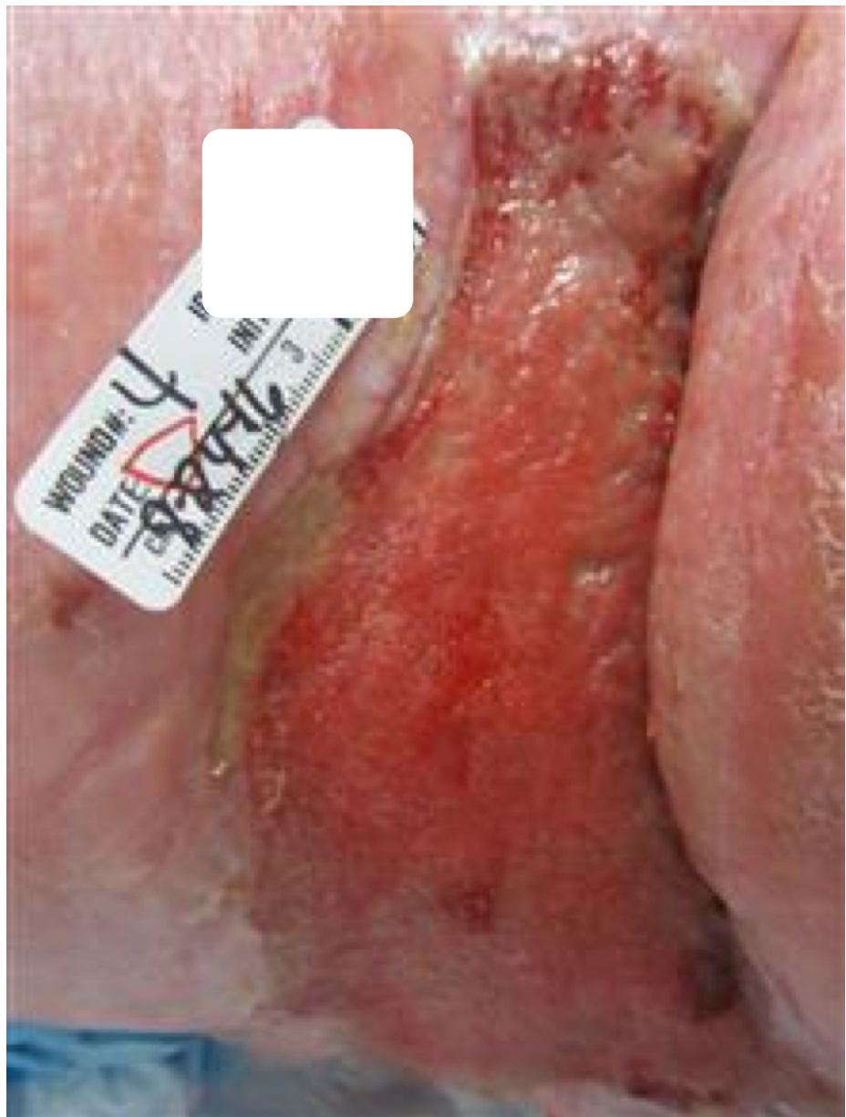
FIGURE 6: Right Upper Thigh Wound - Two Months and One Week Into Healing

Last picture of the wound to date, two months and one week after original surgical debridement. Measurements are 7.5 cm length x 20.5 cm width x 0.1 cm depth. Continued granulation and epithelization tissue with the continuation of negative pressure therapy.