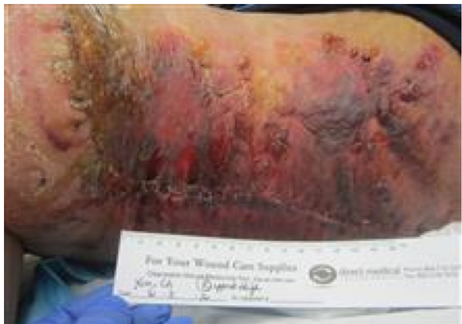
FIGURE 1: Failed Flap, Non-Healing Surgical Wound

Two and one-half weeks later, the patient was referred to the Advanced Wound Care Center by his surgeon. The patient was seen and evaluated for a non-healing, necrotic, failed flap and surgical site. The patient, accompanied by his mother, arrived in a wheelchair to the visit. The wound area was severely necrotic, edematous with areas of scattered hematomas and blistering. The wound area was moderately warm to the touch with areas along the incision line of small dehiscence and draining serosanguinous and necrotic/brown exudate. The patient described the wound area as having intermittent sharp pains with occasional throbbing pain and burning sensations. The affected area measurements were 31 cm length x 21 cm width x 0.1 cm depth (Figure 1).