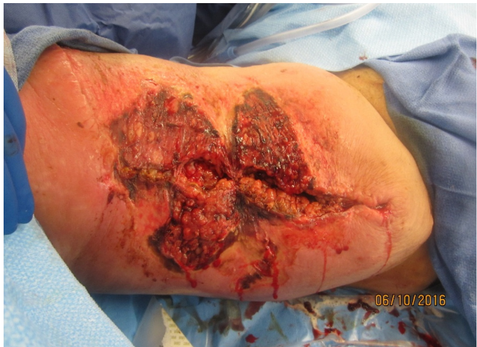
FIGURE 3: Completed Surgical Debridement of Right Upper Thigh Wound

The surgical debridement was complete, presenting a cleaner wound bed. Part of the debridement was full-thickness, extending into the subcutaneous area. Superficial debridement was also performed to remove non-viable tissue. The hospital's Wound Care advanced practice registered nurse (APRN), was present in surgery and applied the VeraFlo™ instillation and dwell time negative pressure wound vac. Settings were: 18 minutes soak and dwell time of normal saline, every 2.5 hours with 125 mm/hg of constant pressure.