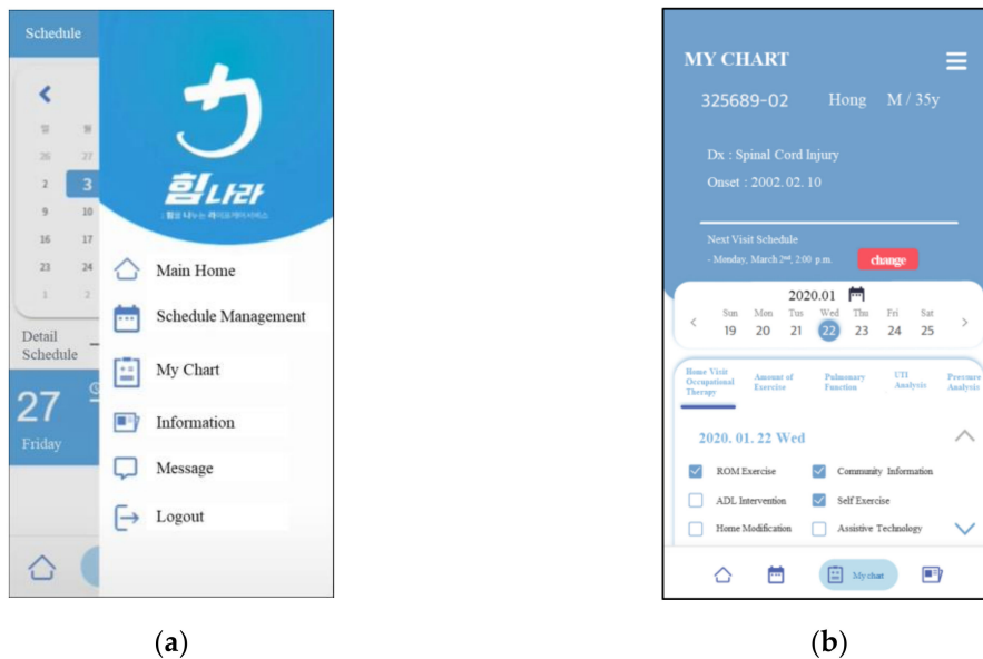
Figure 3. App (application) service of health care management: (a) The app is running and (b) the user can verify all of the scheduled activities.

ICT-based applications (Figure 3) were developed with two groups in mind—study participants and visiting therapists—resulting in two versions of the app. The differentiating feature of the participant’s version is that their access is limited to only their own file. Participants logged into the app can typically monitor their health information and also schedule their next visit with the therapist. Participants can also send and receive messages via the app directly to therapists or doctors. The second version is customized for the home visiting therapists. The application allows them access to all of the entered information of the participants to whom they have been assigned. Direct communication with participants and physicians using the app is also feasible. Data input is allowed while home visits are in progress or up until the end of the following day. Physicians can communicate any resultant data with therapists, while therapists can communicate with physicians for any consultative advice while the home visit service is in progress.