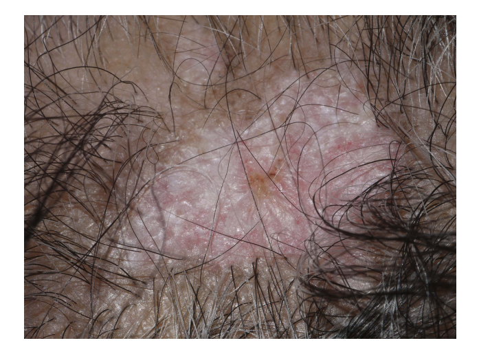
Figure 2 Scarring alopecia due to "burnt-out" discoid lupus erythematosus.

hypopigmentation. Table 1 gives greater detail of the different types of acute and chronic cutaneous lupus.