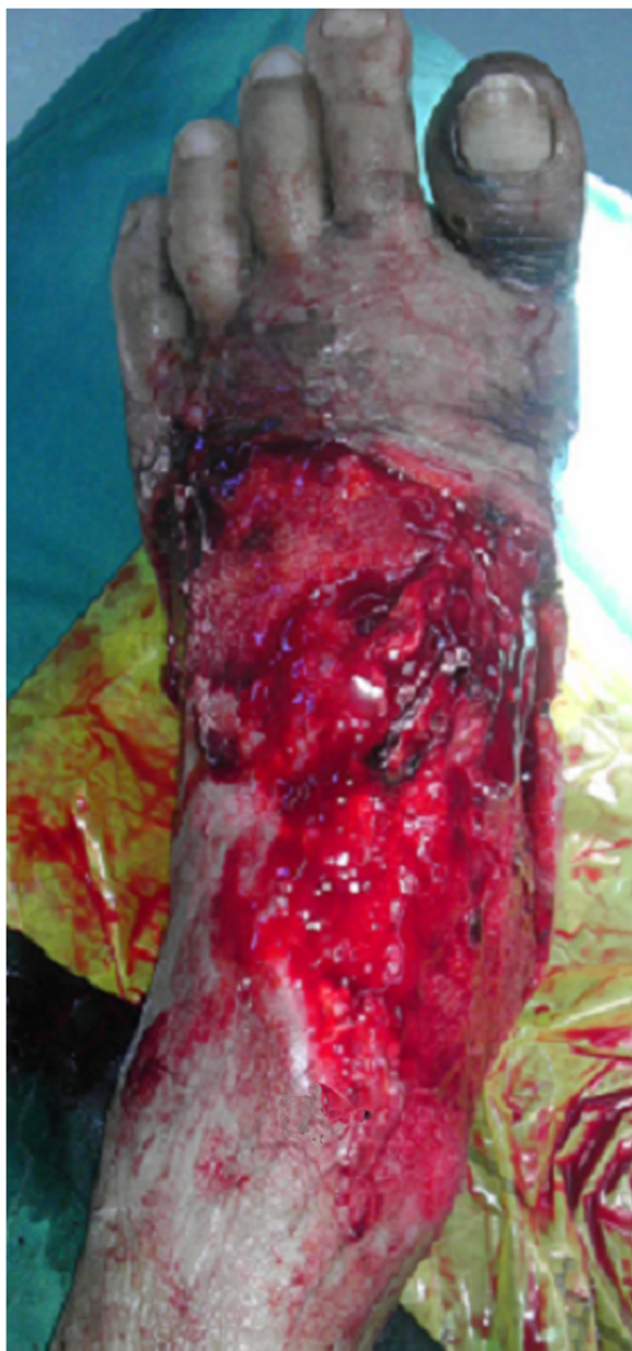
Fig. 1 Preoperative view of the injured foot

the tendon with an adjacent tendon transfer) and a non-operative treatment (non-anatomic repair) on patients with anterior tibialis tendon ruptures and suggested that young active patients are advised to be treated with surgery while older patients should be treated conservatively in their series. However, Sammarco et al. [2] compared the outcomes of early surgical treatment and delayed surgical treatment (the treatment consisted of tendon graft and direct repair) and concluded that the desired level of activity of patients and the functional deficit, other than the age and the time from the injury alone, should be used for indicators of surgical repair. In our study, the subjects