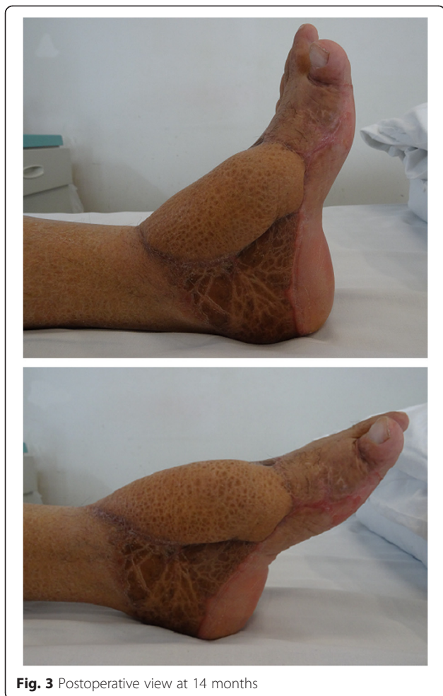
Fig. 3 Postoperative view at 14 months

A suture anchor or a bio-tenodesis screw is often used for the reconstruction of the insertion of the tibialis anterior tendon. However, this study employed the plate and screw fixation technique to reconstruct the insertion because of its advantages. The screw can fix the tendon to the bone as point, and the plate can fix the tendon as flat. According to the physics formula of pressure ( p ) = force ( f )/square ( s ), large square results in small pressure when muscle tension is constant. The plate and screw fixation technique may increase the square and decrease the pressure, thereby improve the firmness between the bone and the tendon. In this study, two patients removed the cast a week after the operation. At the last interview, both of them had a manual strength of 5/5 and walked without any visible limp. These results indicate that the technique decreased the duration of cast immobilization compared with previously published reports. However, no valid statistical approach could be performed because of the small sample size. Therefore, in our future research, we will use a large sample size to validate the results statistically.