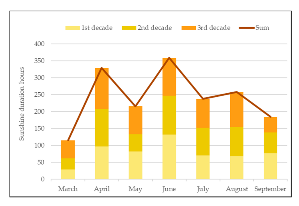
Figure 2. Sunshine duration in nettle growing period (Kaunas meteorological station).