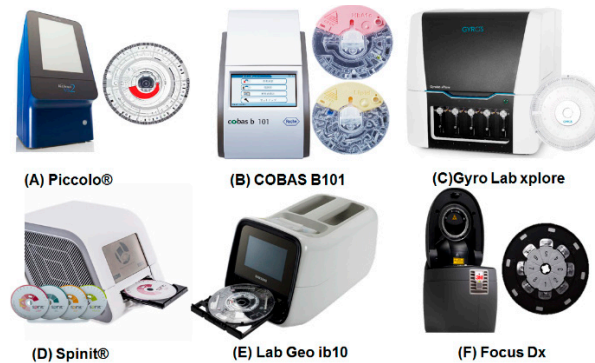
Figure 3. Examples of centrifugal microfluidic-based diagnostic devices for POCT settings: (A) Piccolo ® by Abaxis (Union City, CA, USA); (B) COBAS B101 by Roche Diagnostics (Indianapolis, IN, USA); (C) Gyro Lab Explore by Gyros (Uppsala, Sweden); (D) Spinit ® by Biosurfit (Lisboa, Portugal); (E) LAB GEO ib10 from Samsung healthcare (South Korea); (F) Focus Dx (Quest) by 3M (Cypress, CA, USA).

high precision and sensitivity. The commercially available IVD centrifugal microfluidic devices in Figure 3 can perform these complex biological applications in the “sample to answer” manner. These devices can be applied to perform individual applications such as blood chemistry measurements, lipid profiling, virology, etc.