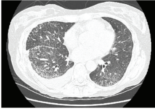
FIGURE 1: HRCT showing UIP (followup scan, May 2008).