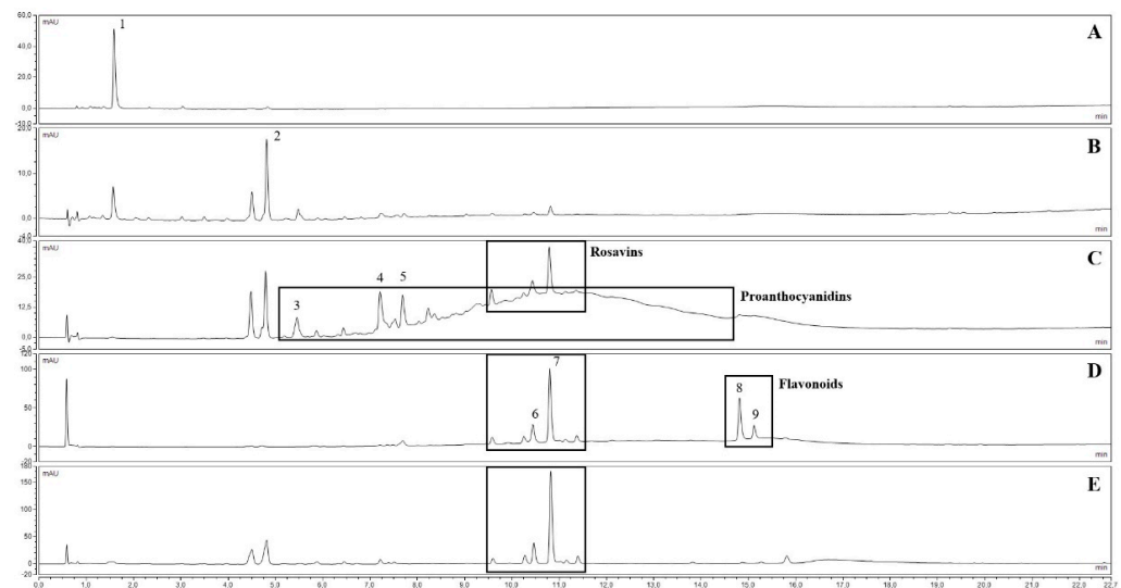
Figure 1. UV chromatograms at 270 nm of “Mattmark” fractions (A): Fraction 1 (M F1 0%); (B): Fraction 2 (M F2 20%); (C): Fraction 3 (M F3 40%); (D): Fraction 4 (M F4 70%); (E): Fraction 5 (M F5 PVP). Compounds: 1 = gallic acid, 2 = salidroside, 3 = EGC-EGCG dimer, 4 = EGCG-EGCG dimer, 5 = EGCG, 6 = rosarin, 7 = rosavin, 8 = rhodiosin, 9 = rhodionin; for details see Table S1.