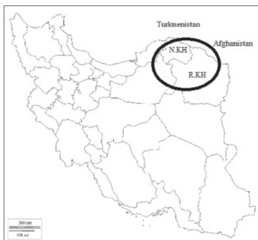
Figure-1: The provinces of the North and Razavi Khorasan in Iran.

ITS1=Internal transcribed spacer 1, ND1=Nicotiamide adenine dinucleotide dehydrogenase subunit I, CO1=Cytochrome oxidase subunit I