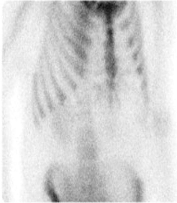
Figure 1. Nuclear Medicine Imaging revealing enhanced activity at the sternum suspicious of inflammation

Nuclear medicine imaging revealing enhanced activity at the sternum suspicious of inflammation.