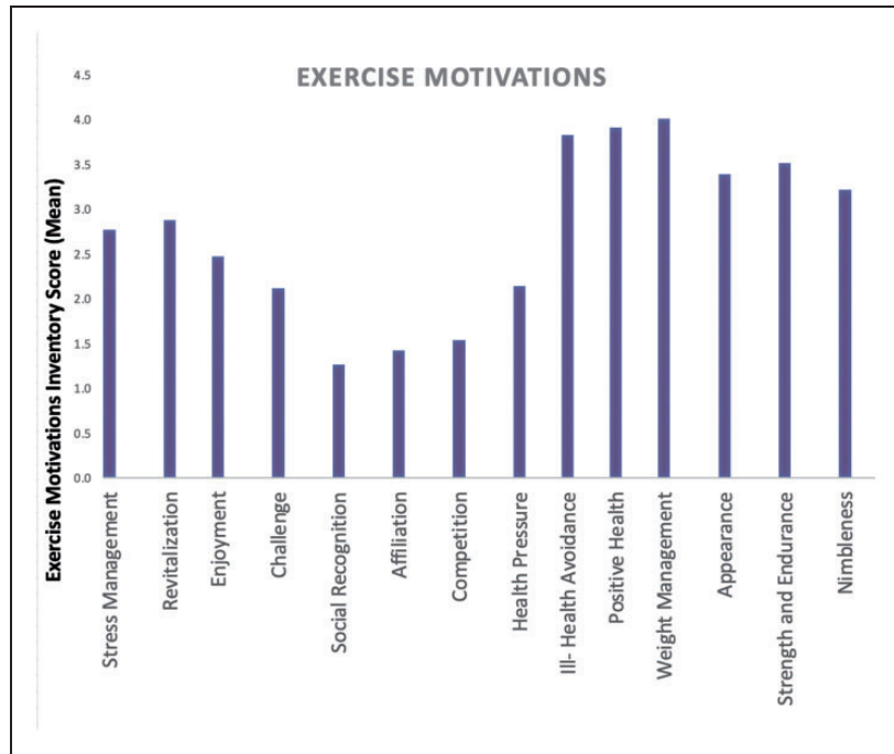
Figure 2. Exercise Motivations of Study Participants as Assessed by the Exercise Motivations Inventory.