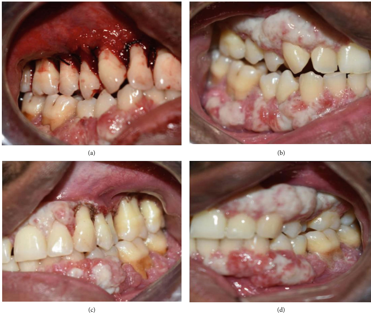
FIGURE 6: (a) Surgical excision by internal bevel gingivectomy on the right maxillary region. (b) 3-Month follow-up shows recurrence of the lesion. (c) Excision by diode laser on left maxillary region. (d) 3-Month follow-up shows recurrence of the lesion.

additional significant role in the pathogenesis of this disease [5, 10, 31]. The average age of patients reported in the literature with ligneous periodontitis is 12-18 years, while isolated cases have been reported in older patients; these differences may reflect variability in PLG activity due to different plasminogen gene mutations [32].