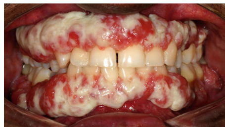
FIGURE 1: Intraoral examination of a 26-year-old male patient with PLG deficiency (Type 1) showing membranous gingival enlargement.

A 26-year-old male patient reported to our clinic with complaints of generalized swelling of gums and pain and bleeding from gums. Gingival enlargement was present since childhood and was slowly increasing in size. The enlargements had been previously localized in sites and had been surgically excised at 8 years of age, but recurrence occurred. He had periodic oral prophylaxis done. He was the third child of second degree consanguineous parents. At birth, he presented