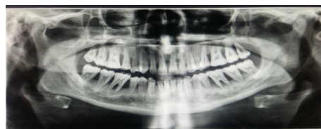
FIGURE 2: Panoramic radiograph showing extensive generalized periodontal breakdown.