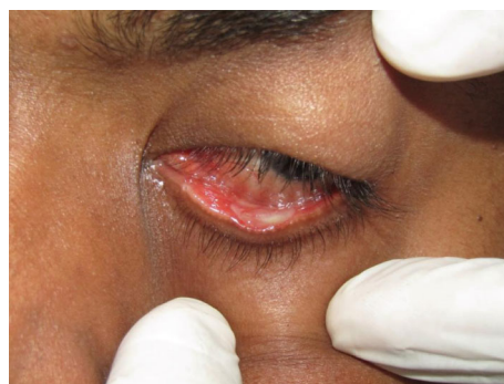
FIGURE 3: Ligneous conjunctivitis.

with multicystic hydrocephalus which was drained by ventriculoperitoneal shunt. Since an early age, he also presented with profuse granulomatous growth in conjunctiva in both eyes. Corneal involvement and chronic obstruction led to the progressive blindness of the left eye by the age of 15. Histopathological evaluations led to a diagnosis of ligneous conjunctivitis.