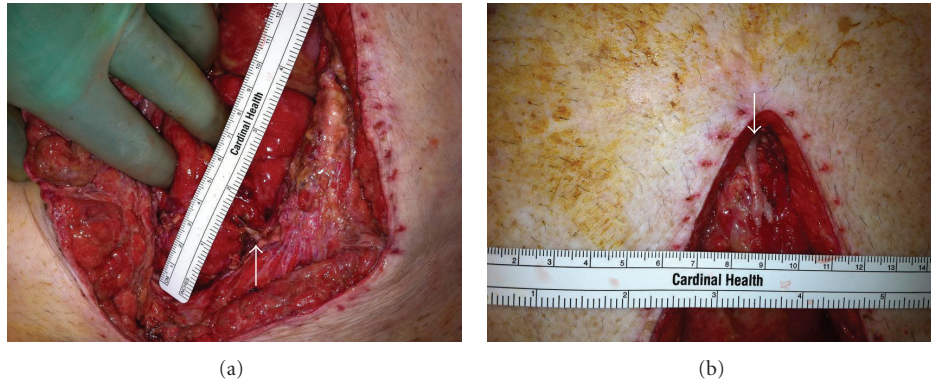
FIGURE 1: Intraoperative photographs demonstrating the (a) location of 3 mm × 1 cm heterotopic ossification within inferior midline wound and repaired small bowel perforation. Arrow denotes heterotopic ossification emanating from the wound. (b) Additional area of heterotopic ossification, 7 mm × 2.3 cm, in superior aspect of the wound. Arrow denotes heterotopic ossification emanating from the wound.