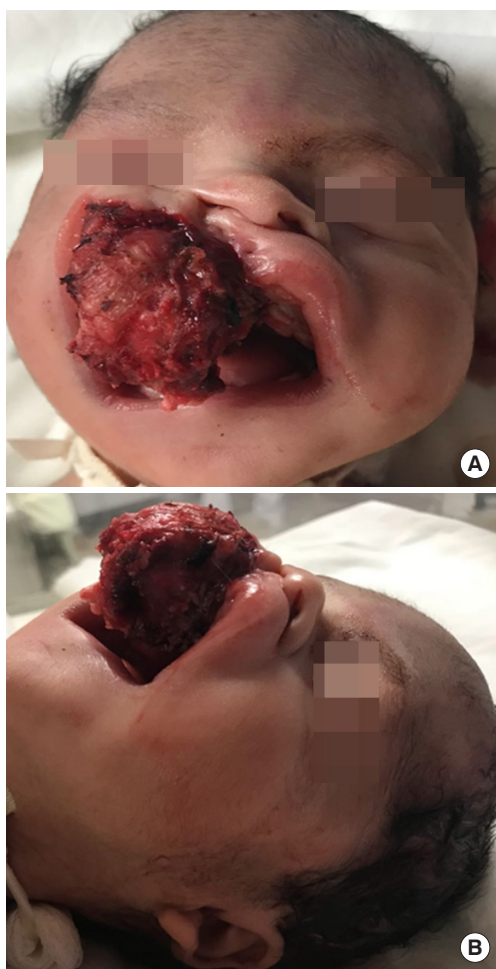
Fig. 2. Residual tumor protruding through the mouth. (A) Frontal and (B) oblique view of the tumor after extraoral resection.

After the assessment of the newborn with residual tumor (Fig. 2) by our plastic surgery service, we opted to plan her surgical treatment using virtual image reconstruction (3D CT) to more