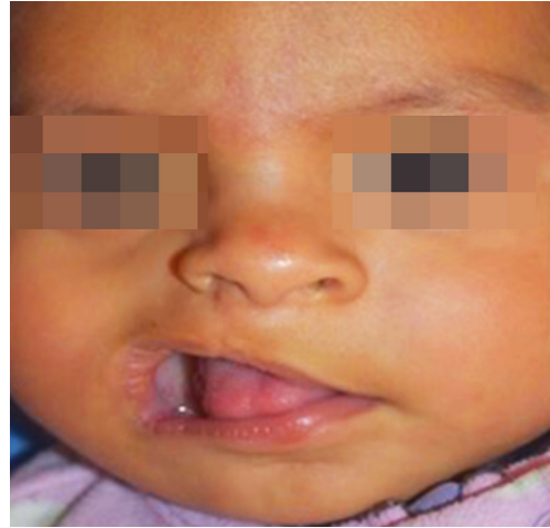
Fig. 6. Postoperative view of the patient. General appearance of the face at 6 months.

The postoperative period was uneventful; the patient was discharged 10 days after the surgical procedure in agreement with the pediatric surgery service, and subsequent clinical evaluations continued in the outpatient clinic. The following 6 postoperative months passed with adequate healthy-child control. The most predominant aspect was that there was no evidence of tumor recurrence. The gradual regression of tissue distention showed a slight improvement in the appearance of the pseudomacrostroma (Fig. 6). Based on this assessment, it was decided to perform the closure of the cleft of the soft palate. This was