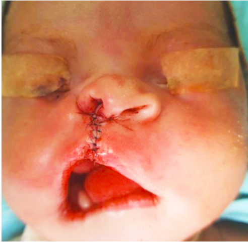
Fig. 5. Intraoperative view of epignathus resection. Final appearance after a bloc resection of the intraoral tumor and lip adhesion.

precisely establish the extension, depth, and relationship of the tumor with surrounding tissues (Fig. 3). Based on this large 3D perspective, we were able to establish exactly the limits of the tumor, and therefore the free millimeter margin to be resected.