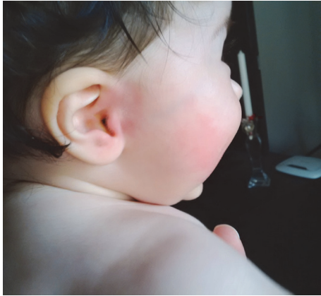
FIGURE 1: Erythema on the right cheek on eating citrus fruit.

an ultrasound of the soft tissue was performed which showed normal facial structures including the salivary glands and slight asymmetry of the subcutaneous fat which was more prominent on the right side. No underlying focal soft tissue lesion or abnormal vascularity was seen.