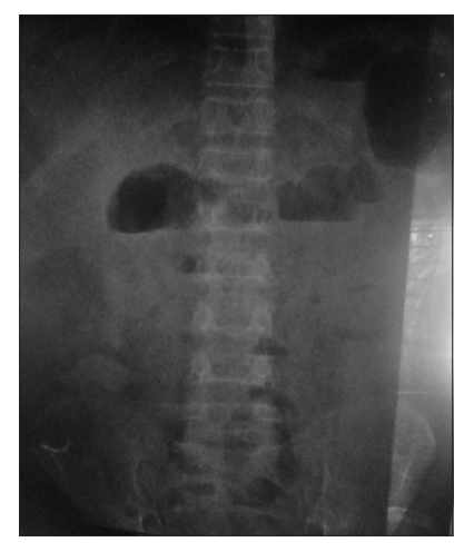
Figure 5: X-ray of the patients Abdomen in Anterior Posterior view before starting treatment

In this poor adult male, an exceedingly rare form of Budd-Chiari syndrome provided a diagnostic challenge and therapeutic uncertainty for our clinical team in the low-resource setting. Primary care physicians who clinically suspect patients to have BCS on basis of the classical triad should prompt the consideration of the small hepatic vein obstruction, despite normal major hepatic veins on an USG. As the absence of extensive diagnostic work-up facilities in a low-resource setting often poses diagnostic and therapeutic challenges for poor patients, management should be routinely commenced with