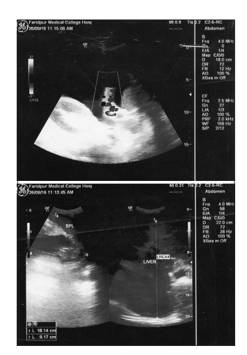
Figure 3: Doppler ultrasound of Porto-Hepatic Venous System

The angiographic study of major hepatic veins and IVC is the current gold standard; however, this facility is largely available only in super-specialized centers and was not a feasible solution for this poor patient. The sensitivity and specificity for the diagnosis of BCS with doppler USG is 85%, indicating that major hepatic venous patency may not rule it out.<sup>[10]</sup> This might