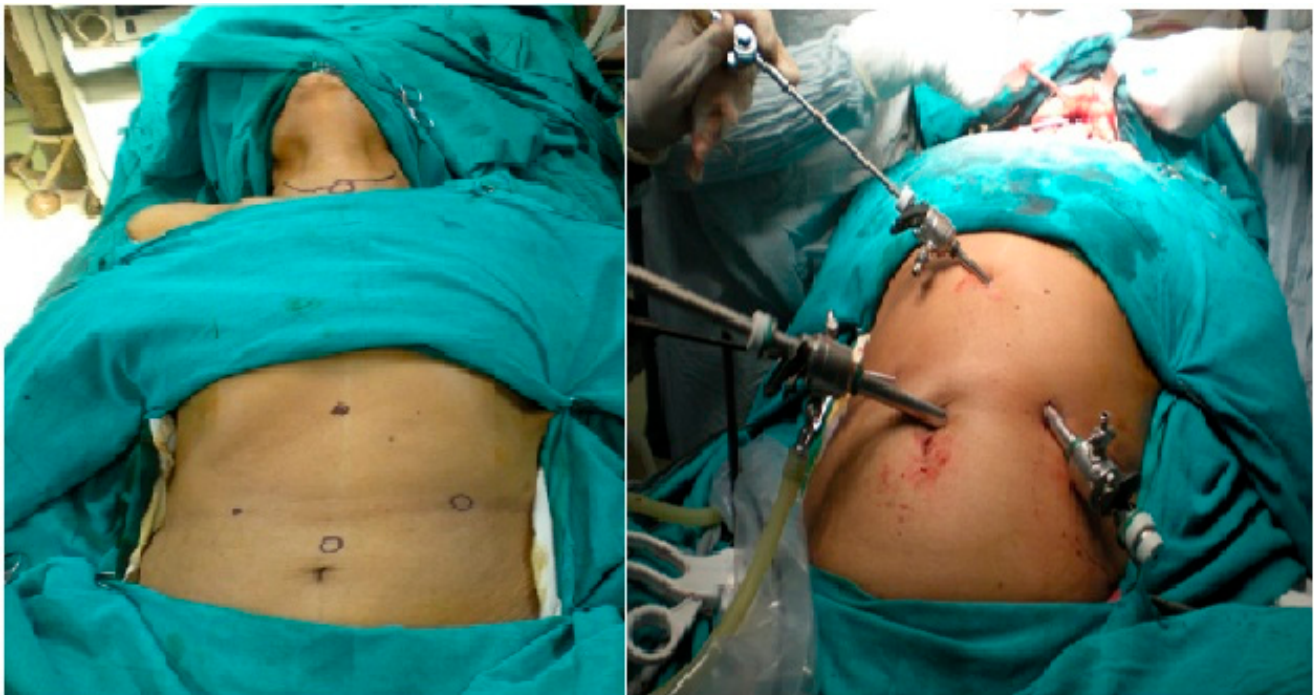
Figure 1. Port placement.

The neck is hyper extended while the patient is in a supine position (Figure 1), sub-platysmal flaps were raised, the involvement of internal jugular vein, carotid artery, pre vertebral fascia was excluded, and the modified neck dissection was carried out in N0 disease. In case of palpable nodes, a complete neck dissection was done, the post cricoid tumor was excised inferiorly to the base of tongue, and the distal level of transection is determined by the extent of the disease. If it is limited to above the thoracic inlet, then resection of the larynx, pharynx, and cervical esophagus would be sufficient. If extent of the tumor is below the thoracic inlet, then the entire esophagus is removed.