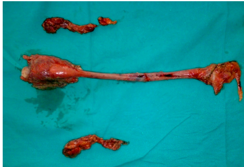
Figure 3. Laryngopharyngo-esophagectomy and neck dissection specimen.