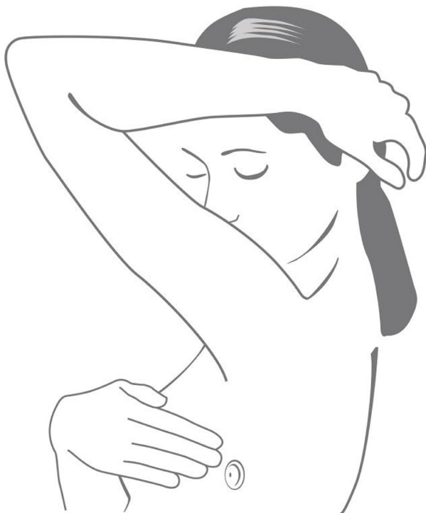
Figure 1 DuoFertility® sensor.

A total of eight patients were recruited for the study. Written consent was obtained from all participants in accordance with the approval from the research ethics committee. Women were advised to start testing their first morning sample of urine using luteinizing hormone tests (ClearBlue® ovulation test; Swiss Precision Diagnostics GmbH, Geneva, Switzerland) on day 8 of their cycle and to come for an ultrasound scan on the day of the first positive ovulation test. Transvaginal ultrasound scanning was repeated daily until evidence of ovulation was obtained in the form of collapse of a previously seen follicle. A maximum of four ultrasound scans per cycle was performed on each patient. The presence or absence of free fluid in the pouch of Douglas was noted. Serum progesterone was measured 3–10 days after the presumed date of ovulation. All but three scans of