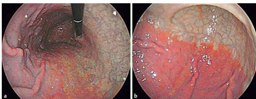
Fig. 3 Representative images of a case of H. pylori infectious gastritis. a Linked color imaging (LCI); gastric body from the retroflex view. b LCI; gastric body from the antegrade view.