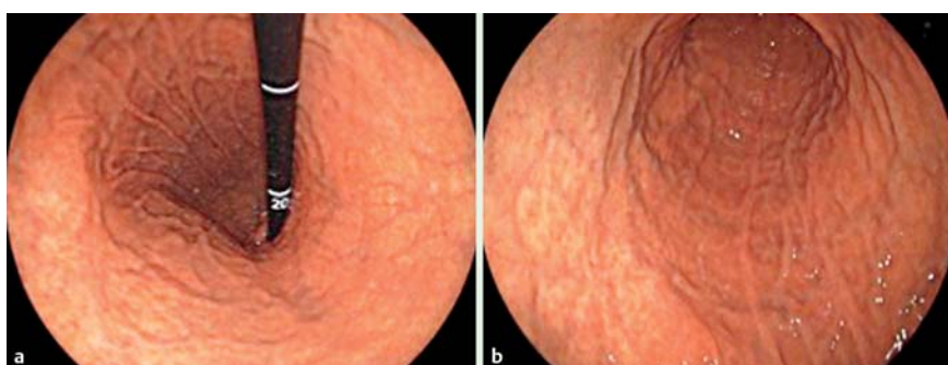
Fig. 4 Representative images of a case testing negative for H. pylori infection after eradication therapy. a White light imaging (WLI); gastric body from the retroflex view. b WLI; gastric body from the antegrade view.