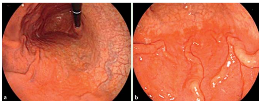
Fig. 2 Representative images of a case of H. pylori infectious gastritis. a White light imaging (WLI); gastric body from the retroflex view. b WLI; gastric body from the antegrade view.